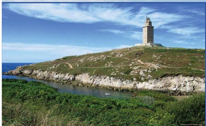
UNESCO's World Heritage - The Tower of Hercules