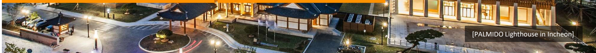
[PALMIDO Lighthouse in Incheon]