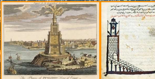
The Lighthouse at Alexandria