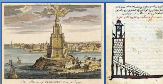
The Lighthouse at Alexandria